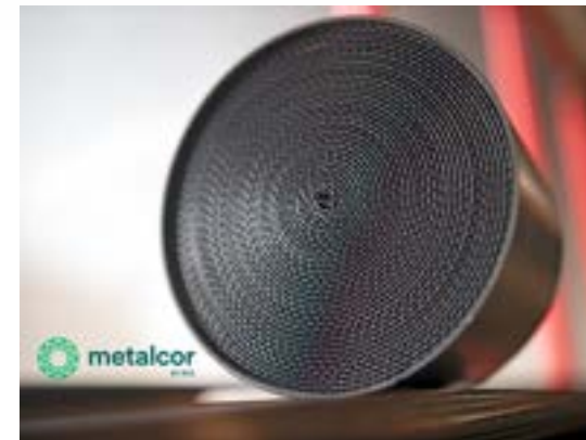
The thin-wall metal honeycomb structure provides high surface area with minimal pressure drop (patent pending).